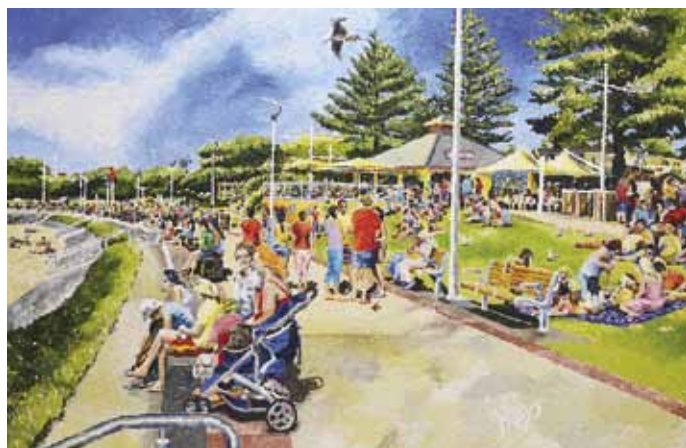
“Lunch @ Belmore Basin”

30 x 40cm or 12” x 16” acrylic on canvas, painted January 2012. $350