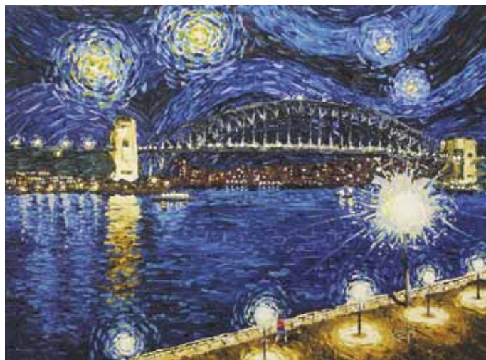
“Homage to Van Gogh #2”

46 x 61 cm or 18” x 24” acrylic on canvas, painted June 2013 $650