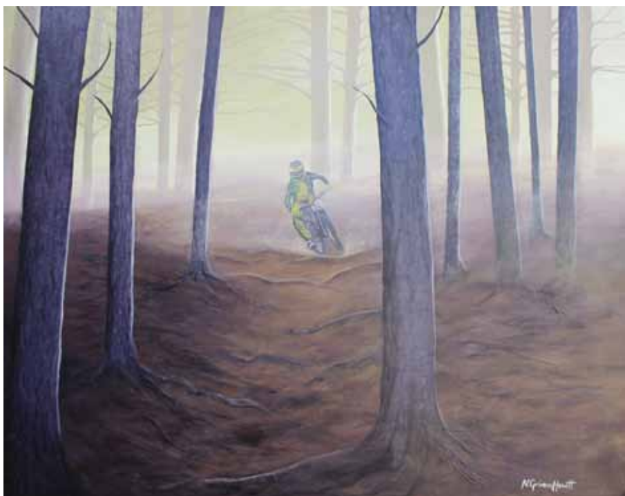
"Into the Forest He Goes" 122 x 91cm or 48" x 36" acrylic on canvas $650