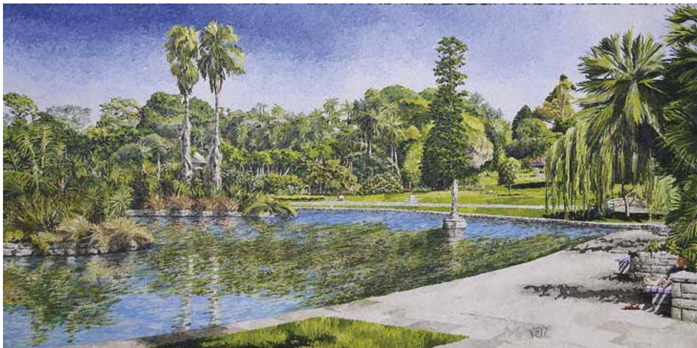
“Sydney Botanic Gardens”

77 x 152cm or 30" x 60" acrylic on canvas, painted April 2013. $1,800