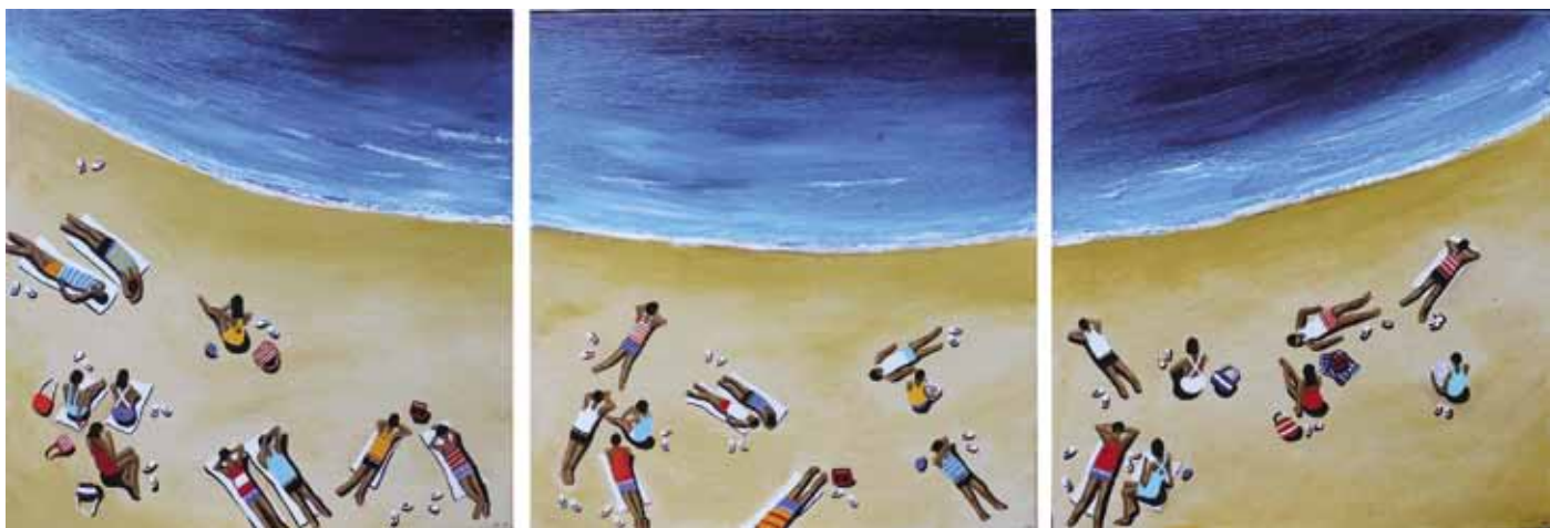
"Bec's Beach" Triptych - 45 x 45cm ea. or 17." x 17.5" ea. $650