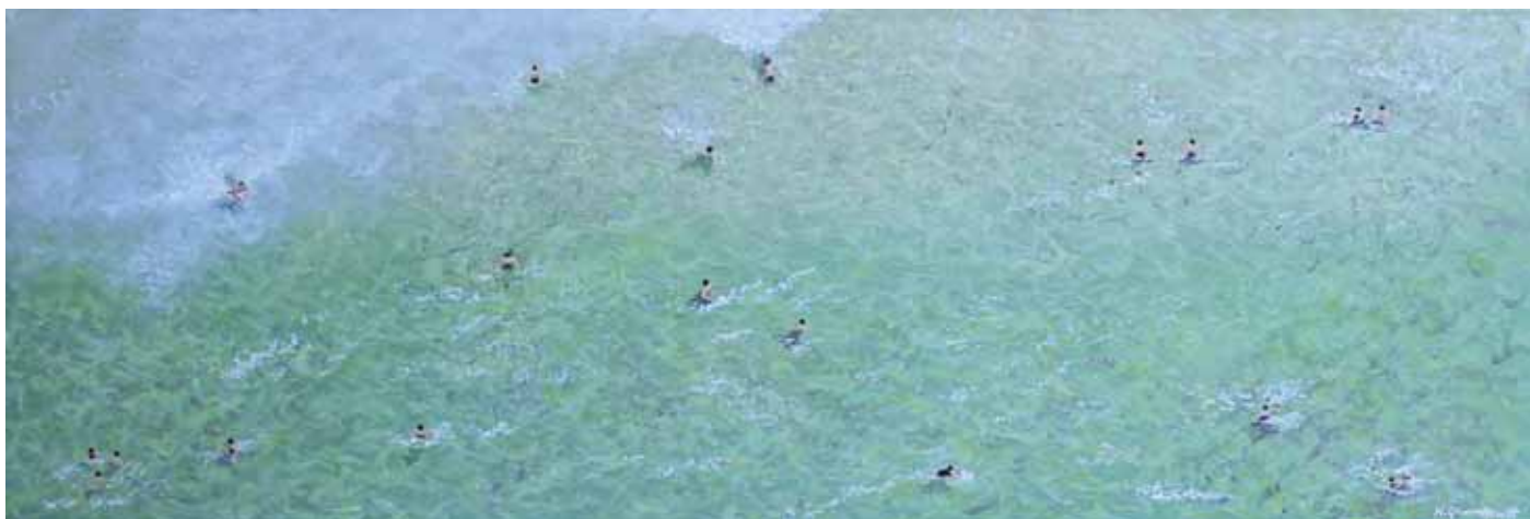
"The Sandbank" 91 x 30cm or 36" x 12" acrylic on canvas $320