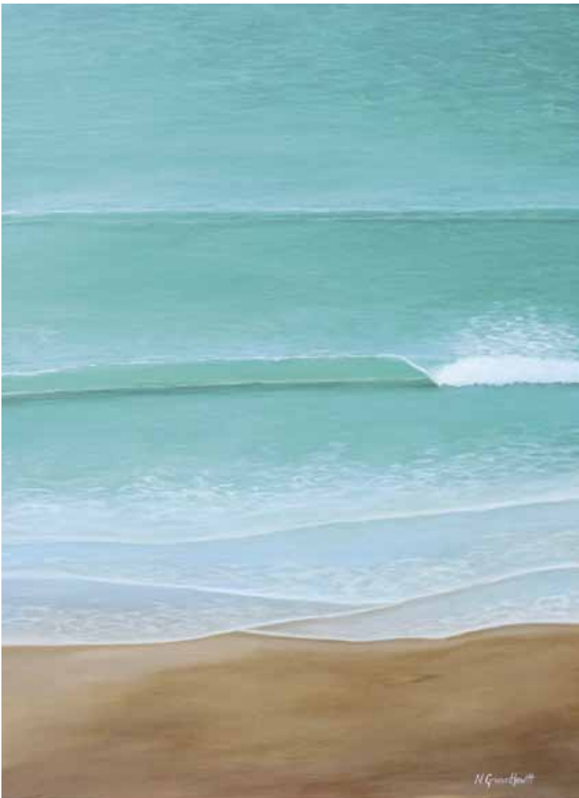
"Gentle Waves" 91 x 122cm or 36" x 48" acrylic on canvas $650