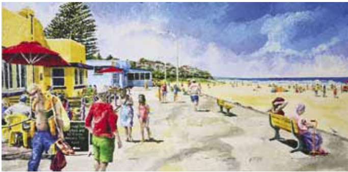
"The Thirroul Kiosk"

45 x 91cm or 18" x 36" acrylic on canvas, painted March 2012. $650