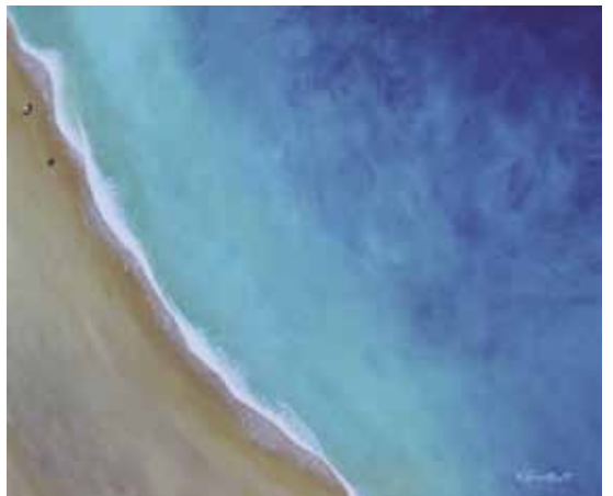
"Wait For Me" 120 x 90cm or 47" x 35" acrylic on canvas $350