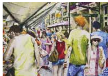
“Market Day @ The Rocks”

101 x 152 cm or 40” x 60” acrylic on canvas, painted May 2013 $3,000