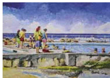
“Swim Lessons @ Bulli Pool”

101 x 152 cm or 40” x 60” acrylic on canvas, June 2012 $2,600