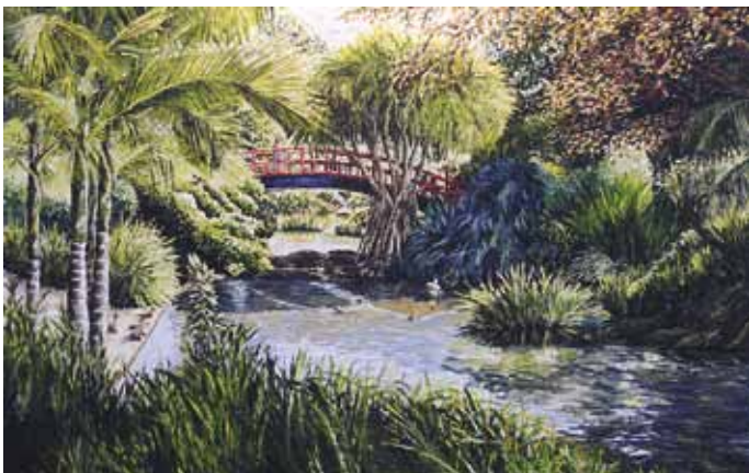
"The Bridge of Reflection"

61 x 122cm or 24" x 48" acrylic on canvas, painted January 2013 $1,200