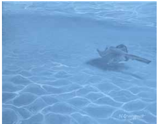
"Underwater Flight" 40 x 30cm acrylic on canvas $160