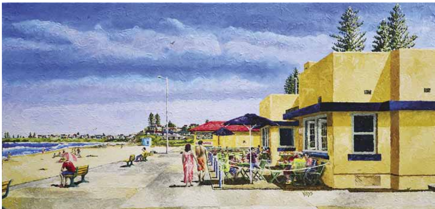
“Lunch @ Thirroul Beach”

77 x 152cm or 30" x 60" acrylic on canvas, painted April 2013. $1,800