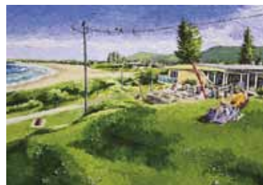
“Balmy Bulli Beach”

30 x 40cm or 12” x 16” acrylic on canvas, painted March 2012. $350