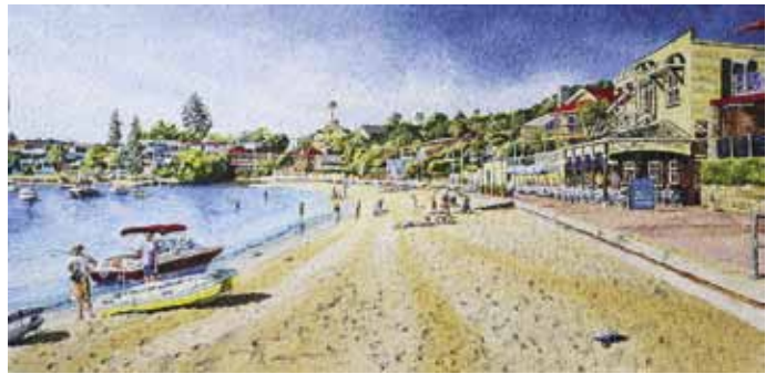
"Watsons Bay on Sunday"

45 x 91cm or 18" x 36" acrylic on canvas, painted March 2012. $650