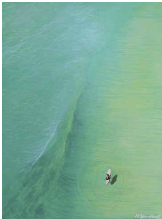
"Time to Myself" 50cm x 60cm or 20" x 24" acrylic on canvas $380