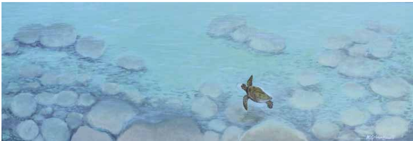
"Across the Rockpool" 91 x 30cm or 36" x 12" acrylic on canvas $320