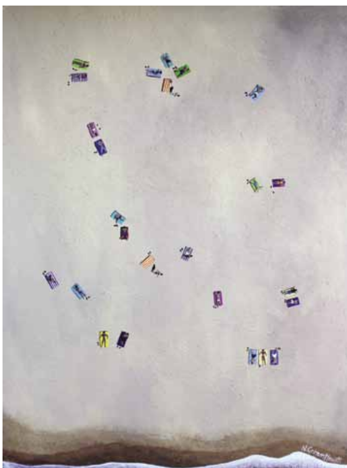
"Beach Candy" 90 x 120cm or 35" x 47" acrylic on canvas $500