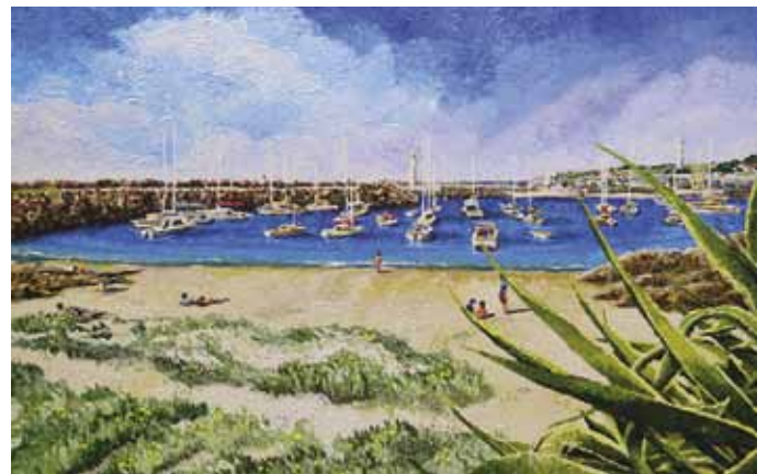
"Sunday @ Belmore Basin"

61 x 91cm or 24" x 36" acrylic on canvas, painted August 2012. $950