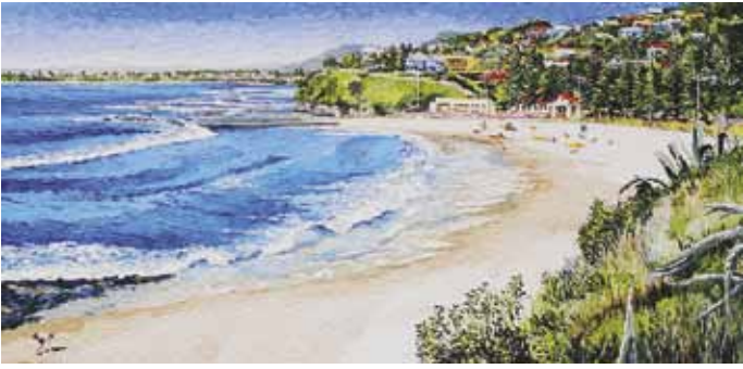
"Austinmer Stone Thrower"

51 x 102cm or 20" x 40" acrylic on canvas, painted November 2012. $900