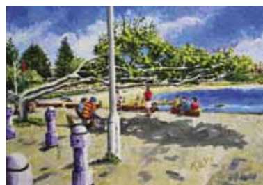
“Bent Tree @ Belmore”

30 x 40cm or 12” x 16” acrylic on canvas, painted March 2012. $440