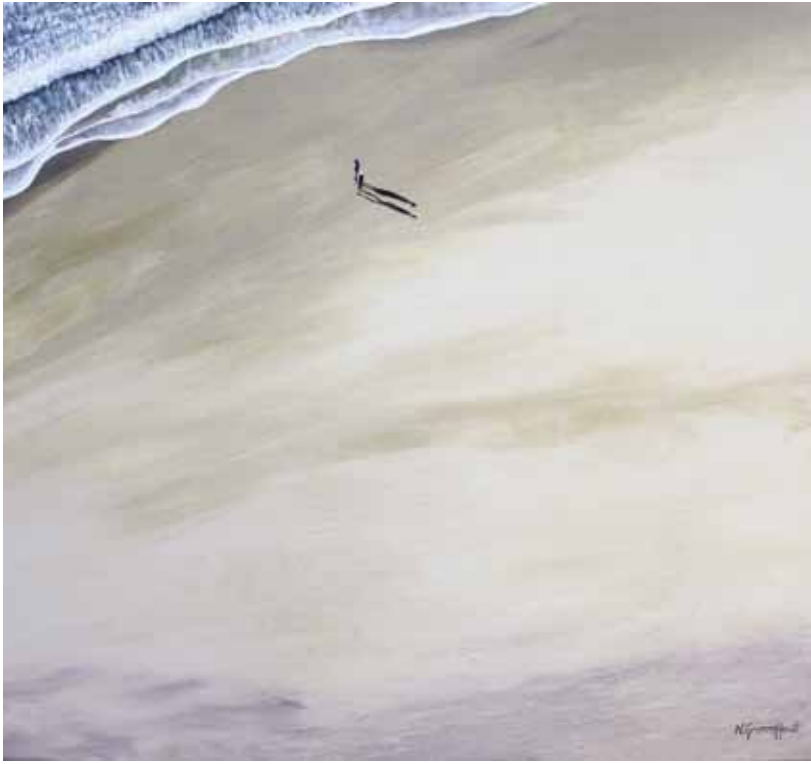
"Winter Walk" 120 x 90cm or 47" x 35" acrylic on canvas $650