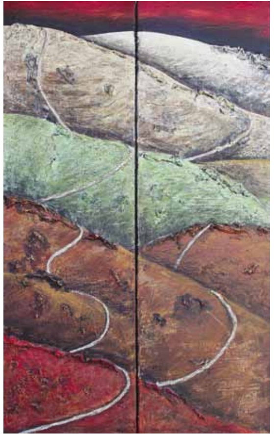
"Rolling Hills" Diptych - 30 x 90cm ea acrylic on canvas $500