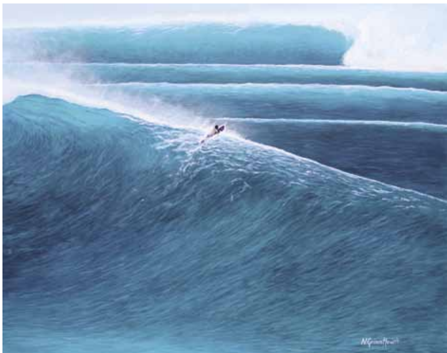
"Over The Top" 122cm x 91cm or 48" x 36" acrylic on canvas $650