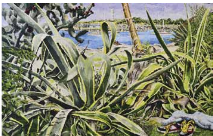
“Belmore Basin Boats”

122 x 183cm or 48” x 72” acrylic on canvas, September 2012 $3,600