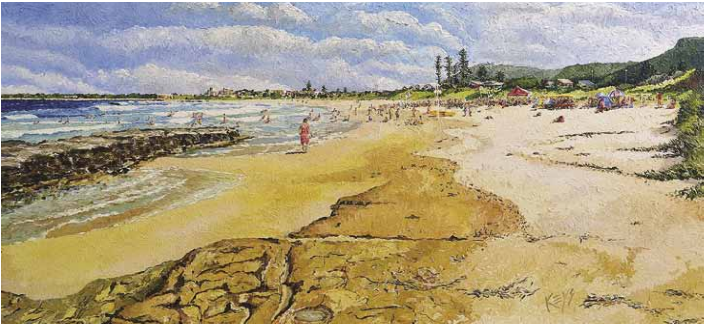
"Bulli Beach Patrol" 61 x 122cm or 24" x 48" acrylic on canvas, painted February 2013. $1,200

46 x 91cm or 18" x 36" acrylic on canvas, painted December 2012 $750