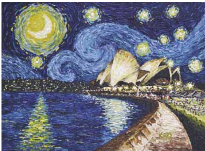
“Homage to Van Gogh”

46 x 61 cm or 18” x 24” acrylic on canvas, painted June 2013 $650