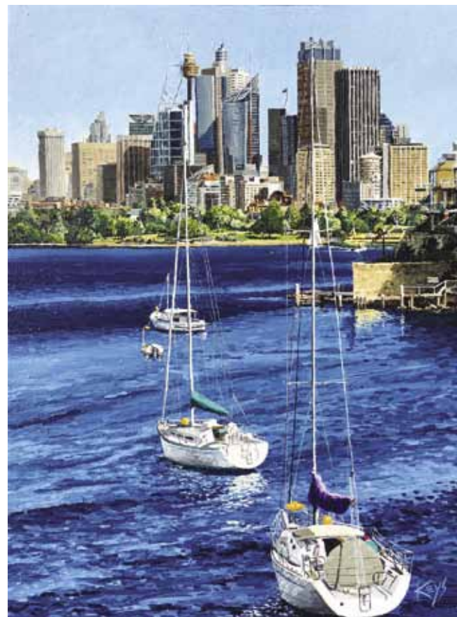
Kurraba Point 61x46cm or 24"x18" synthetic polymer on canvas, September 2016