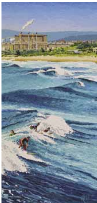
Southbeach Swell 61x30cm or 24"x12" acrylic/canvas