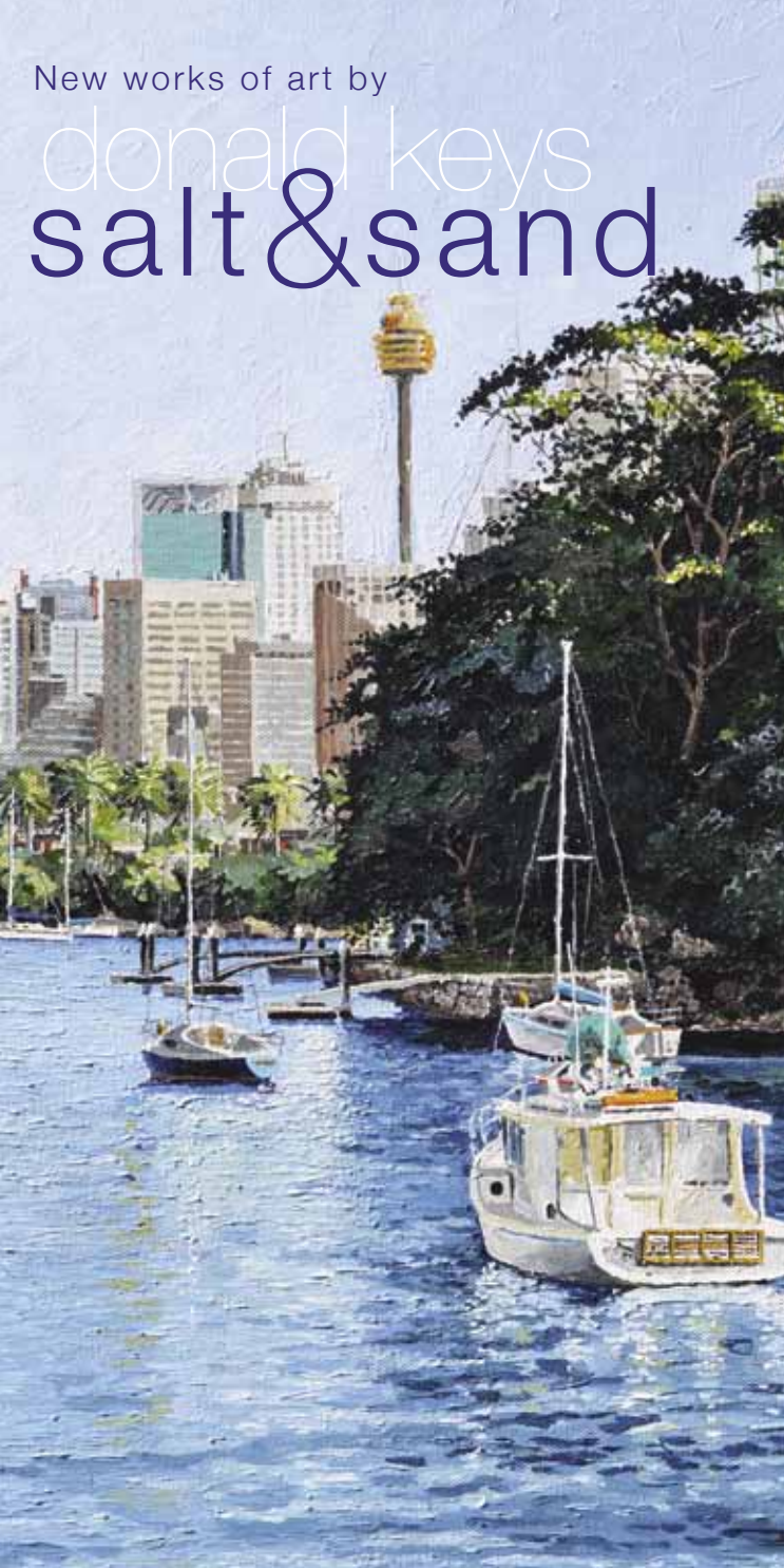
Little Sirius Cove by Donald Keys (61x46cm)