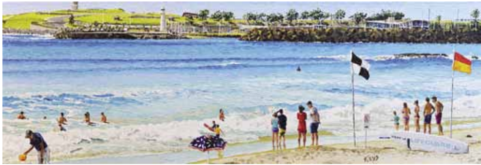
Northgong Flags 31x90cm or 12"x36" synthetic polymer on canvas, May 2016