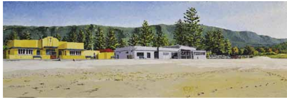
Thirroul Beach Winter 31x90cm or 12"x36" synthetic polymer on canvas, October 2015