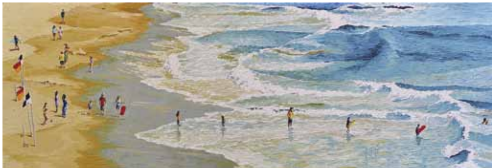
Avoiding The Rip 31x90cm or 12"x36" synthetic polymer on canvas, May 2016