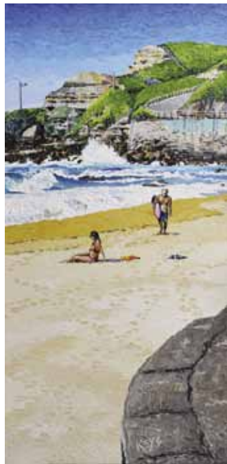
Shortland Esplanade 61x30cm or 24"x12" acrylic/canvas