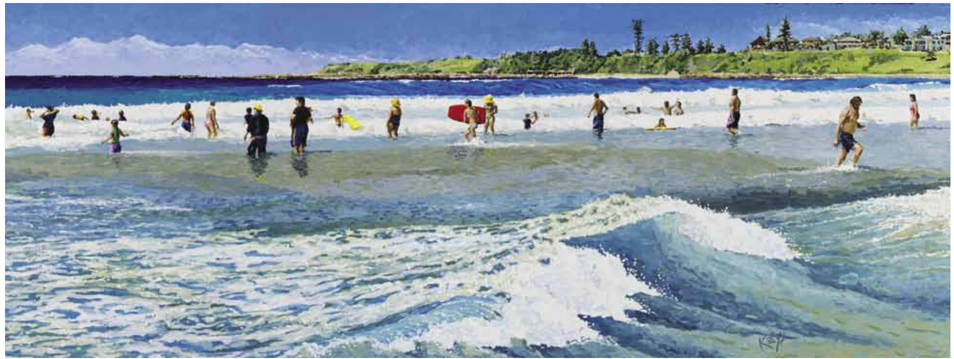
Thirroul Sandbar 61x183cm or 24"x72" synthetic polymer on canvas, February 2016