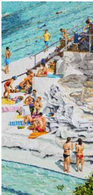
Bondi Bathers 61x30cm or 24"x12" acrylic/canvas