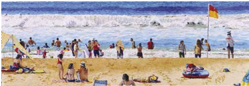
The Attentive Lifeguard 31x90cm or 12"x36" synthetic polymer on canvas, April 2016