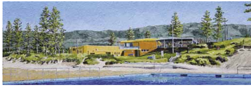
Bulli Pool Winter 31x90cm or 12"x36" synthetic polymer on canvas, August 2015