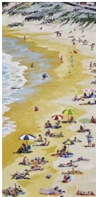
Bar Beach 61x30cm or 24"x12" acrylic/canvas