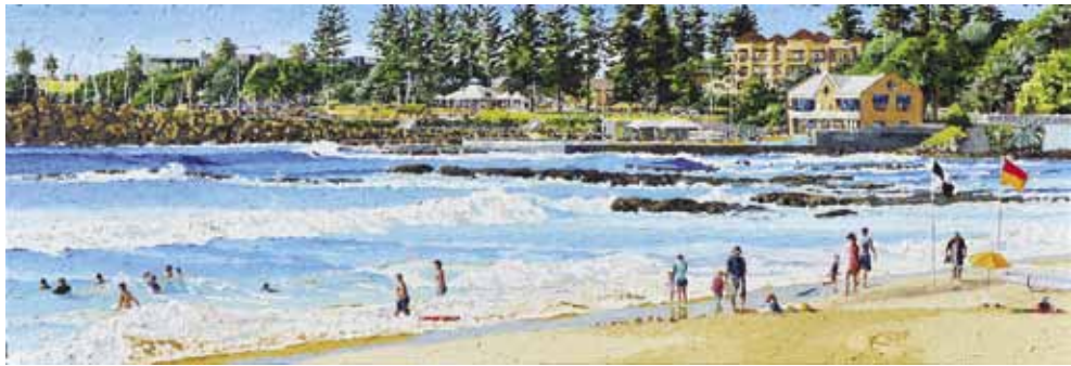
View To Continental Pool 31x90cm or 12"x36" synthetic polymer on canvas, June 2016